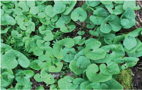
Wild Ginger ( Asarum canadense )

There may not appear to be a direct connection between our yards and gardens to natural ecosystems, but there truly is. Many of the foreign species over taking and damaging native habitats were introduced by well-meaning people purchased from garden shops. Whether the plants moved into other areas by seeds on a hiker's feet, blown by the wind or dumped into the woods by a landscaper matters not; serious damage occurs.